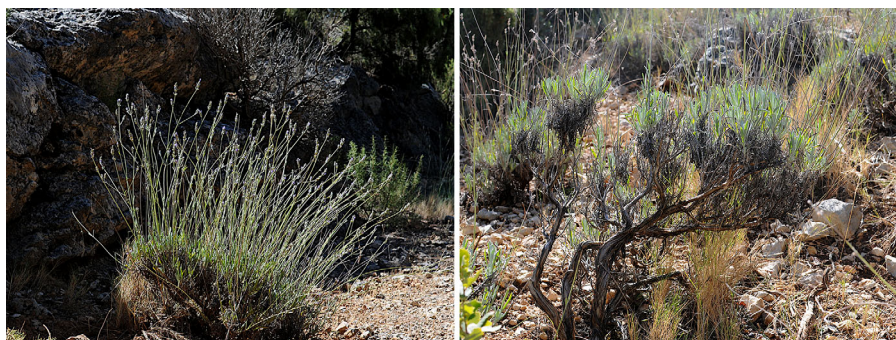
Fig. 2 Mid-aged (left) and older individuals (right) of the lavender Lavandula latifolia (Lamiaceae). These plants accumulate epigenetic mutations in their somatic tissues continuously as they grow and age, and those epimutations are passed onwards within plants via the growth of new tissue and branches. This process of epimutation and internal propagation leads to epigenetic mosaicism, which likely structures subindividual trait variability. This discovery represents a potentially important and previously underappreciated mechanism that could help plants thrive in the face of environmental variability.

Epigenetic mosaicism as a mechanism for coping with variability is so elegant it makes genetic mosaicism look clumsy in comparison. Whereas genetic mutations are essentially random with respect to the environment, epimutations are often adaptive responses to environmental cues. This difference means epigenetic mosaicism